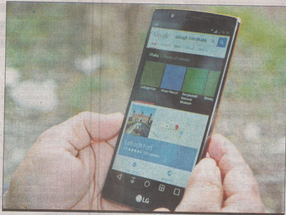
A file photo shows a man browsing the internet on his mobile phone in Dhaka. The National Board of Revenue on Wednesday requested the Bangladesh Telecommunication Regulatory Commission to speed up the auction process of remaining 2G and 3G spectrums which has been delayed for months.

The revenue collection by the telecom regulator declined by 64 per cent in the just concluded fiscal year